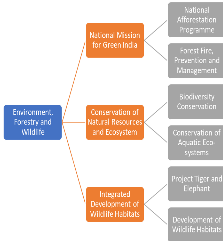
Figure 2: An overview of schemes covered under M/o EFCC 14

The overview of schemes covered under M/o EFCC can be understood by the flow chart given below (Figure 2): -